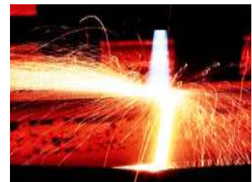
Table 1 below provides data on the economic contribution of the metals and engineering sector to the Philippine economy based on the 2010 Philippine Statistical Yearbook. The average gross value added (GVA) in the sector from 2004 to 2009 was estimated at 50 million pesos.